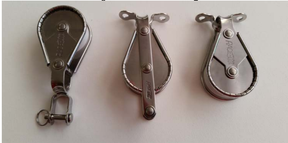
Sheeting hardware for nesting hulls